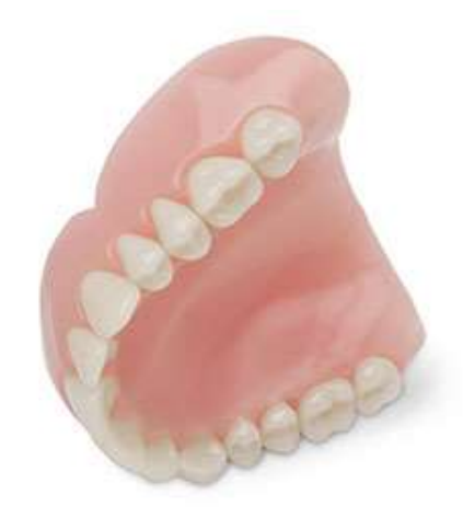
A full upper denture

time to get used to. There are 2 types of complete dentures: immediate dentures and conventional dentures.